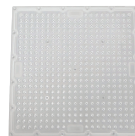
LUHB-V-LENS (Type V Lens)