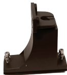
LSB-PM (Square/ Round Pole Mount)