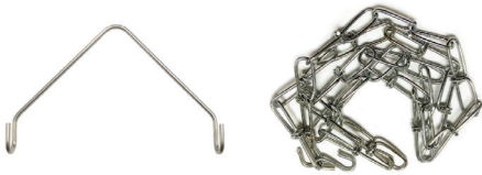
Hook and Chain