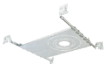
LRSDMP-346 Mounting plate for 3"/4"/6" can-less downlight