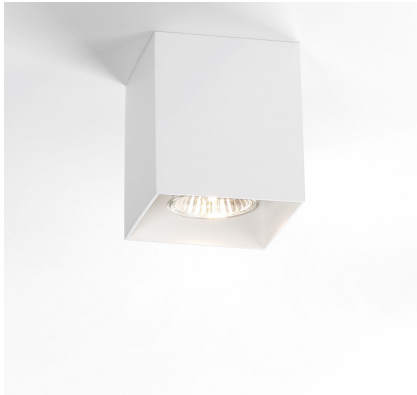
BOX 20 C SHOWN FOR CLARITY